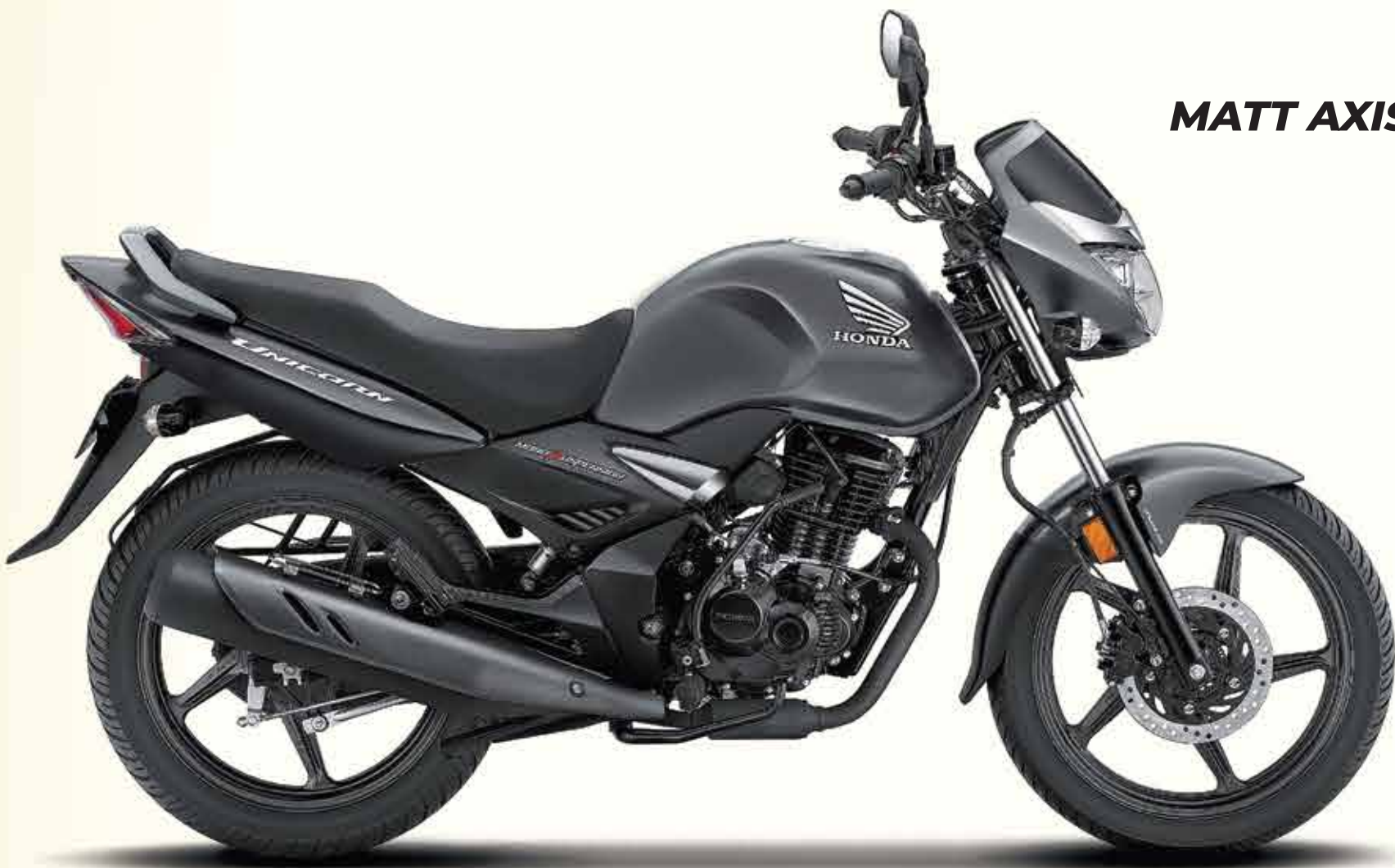
MATT AXIS GREY METALLIC